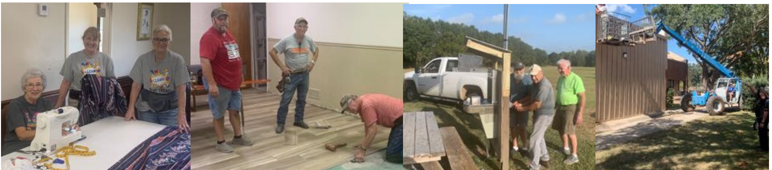
Campers on Mission Work Week