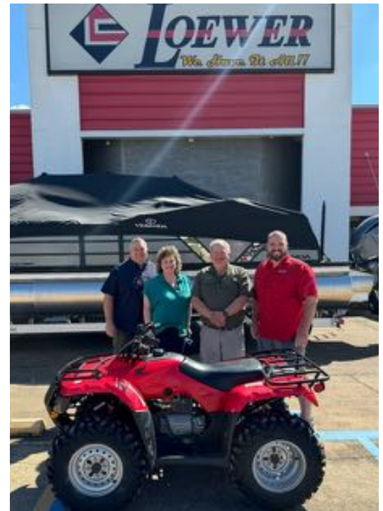
Donation of a 4 wheeler from Loewer Honda