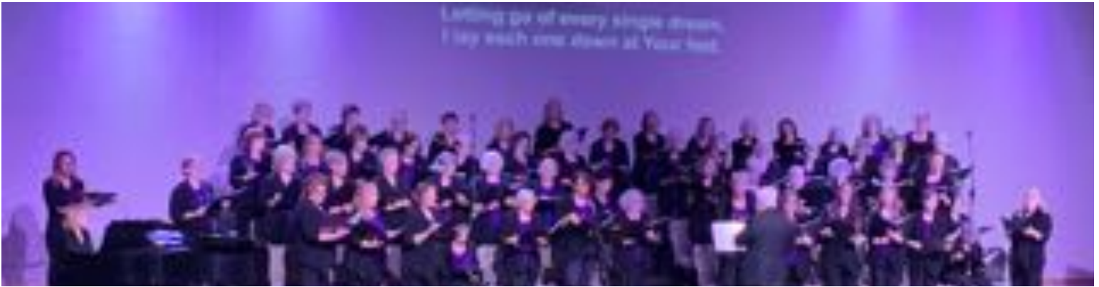
Louisiana Baptist Singing Women Concert