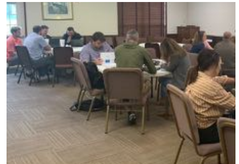
FBC Lafayette Staff Planning Retreat