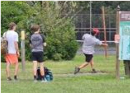
Disc Golf Tournament