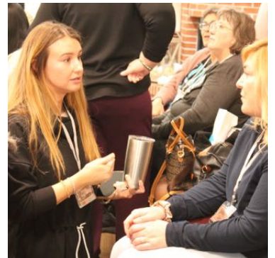
FBC Lafayette Women's Retreat