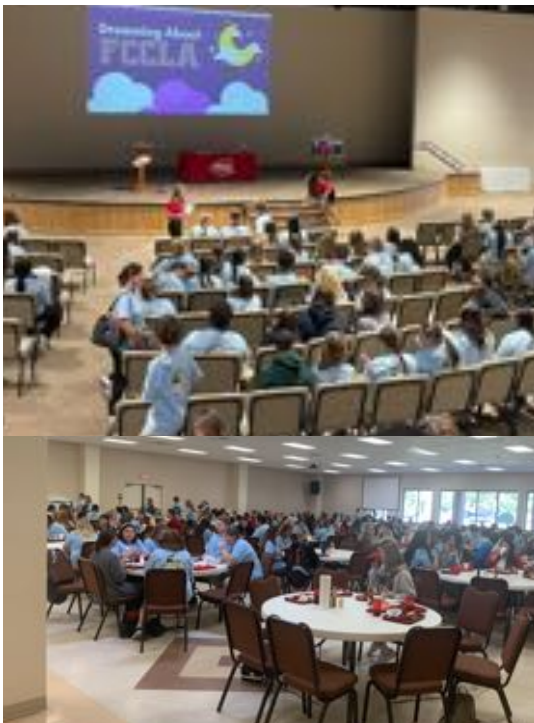
FCLLA State Conference